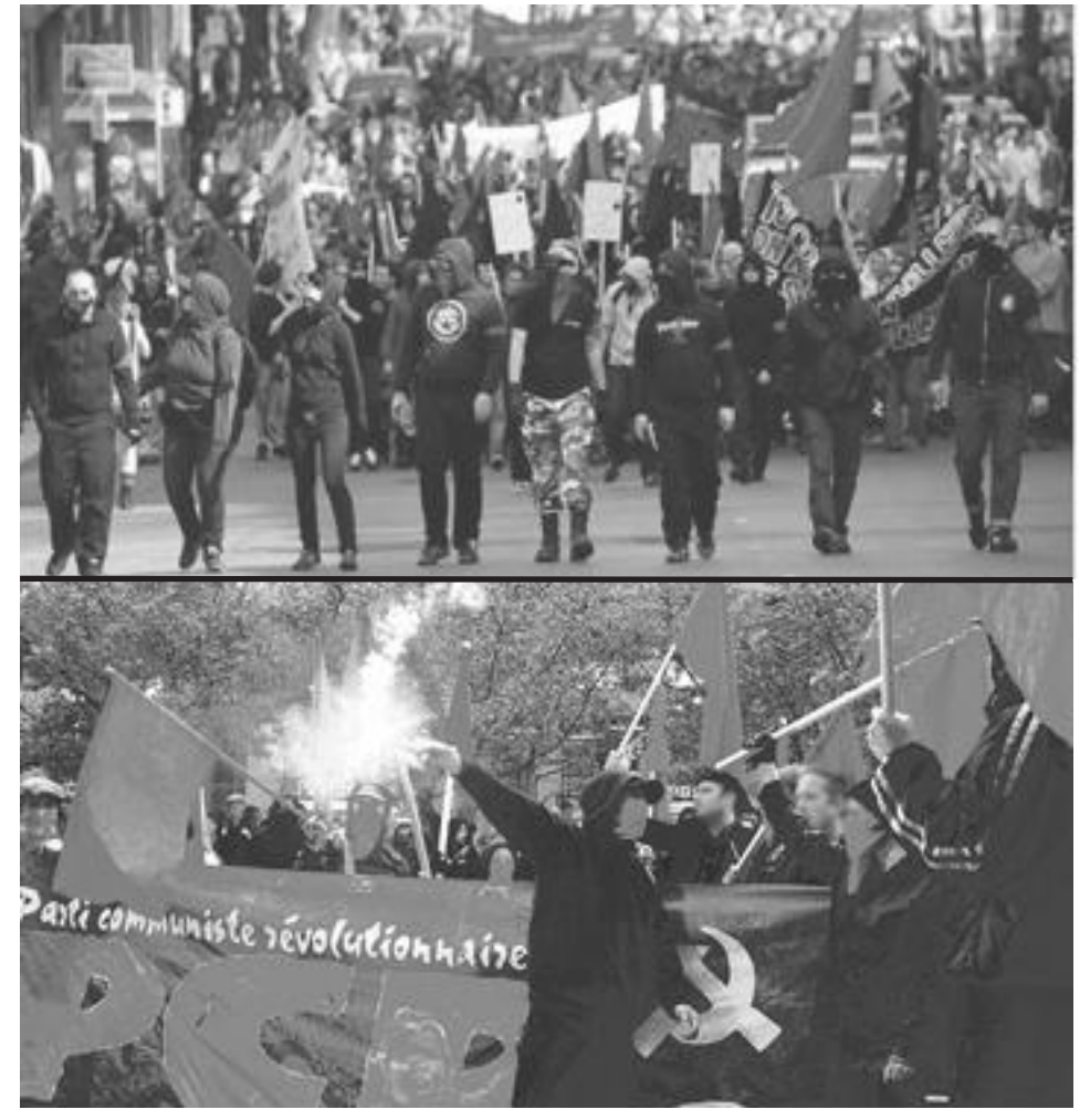
Meeting point and time of the demonstration: Tuesday, May 1^{st} at 4:30 pm at Champs-de-Mars metro station